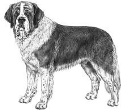
Illustration courtesy of NKU Picture Library